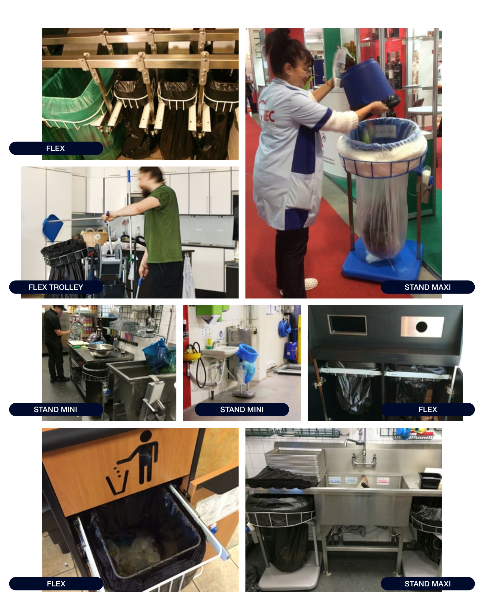
The Longopac system is available in a variety of designs to suit different purposes. There are ready-made solutions with stands to be used in kitchens for instance, cabinets with cassette holders and waste bins. The Longopac system is flexible and can be built into existing cabinets and behind sorting walls. Paxxo also offers metal detectable solutions for environments that require it.